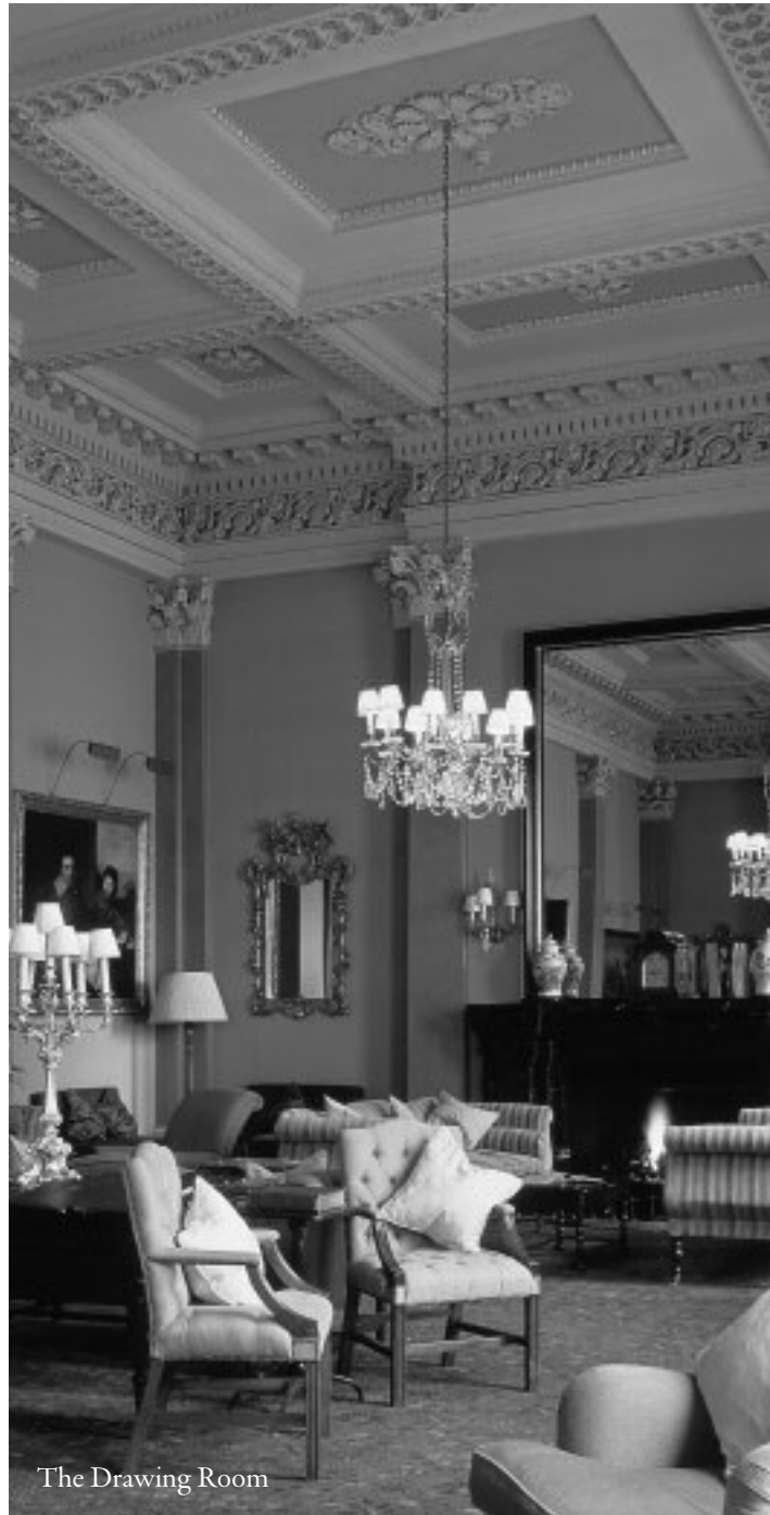
The Drawing Room

Meticulously maintained to reflect its proud heritage, the Carlton Club is nevertheless equipped with modern technology, such as air conditioning and business facilities. Please note that the Club is only available for weddings at weekends.